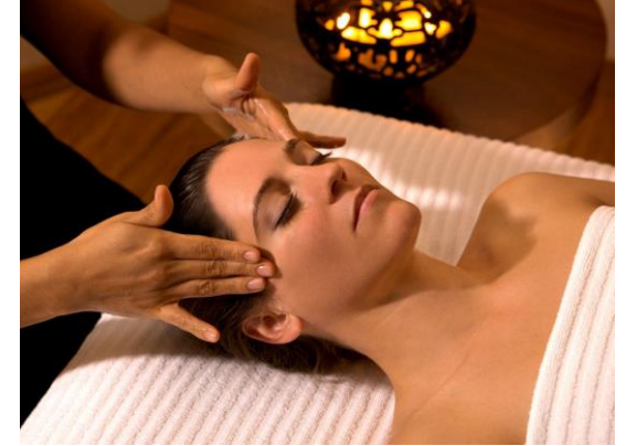
Plenty of Spas and Wellness