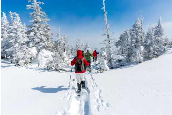
Snowshoeing & winter hiking