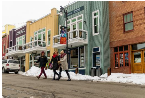
Shopping in Park City