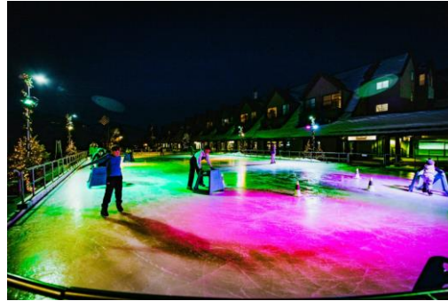
Ice Skating in Park City